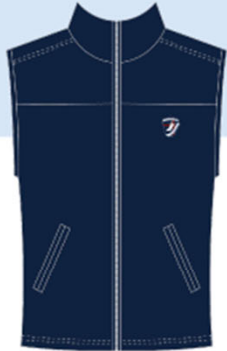
Navy Polar Fleece Vest