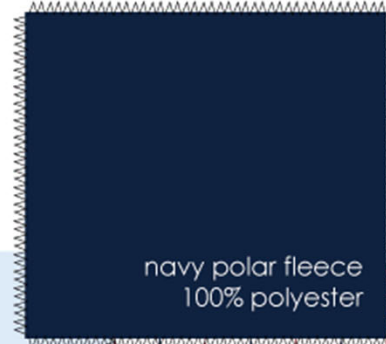
navy polar fleece 100% polyester