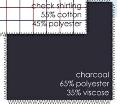
charcoal 65% polyester 35% viscose