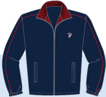
Navy Micro-Fibre Jacket with Polar Fleece Lining