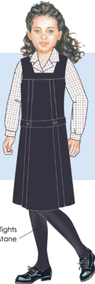
Charcoal Tights Nylon Elastane